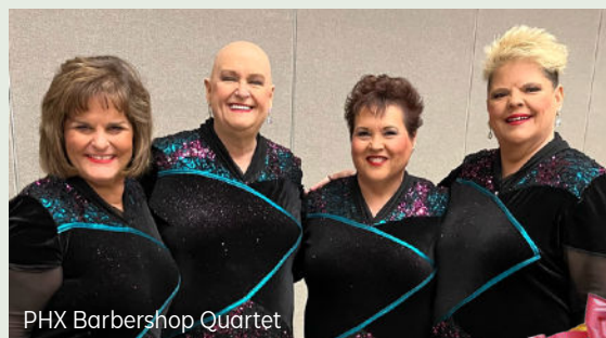
PHX Barbershop Quartet