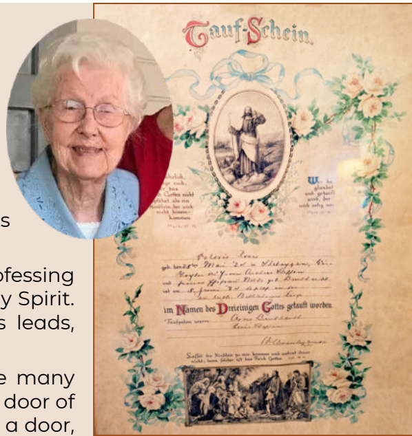
German birth certificate (b. 1924)