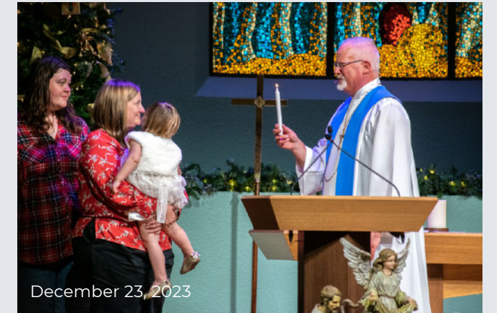
December 23, 2023