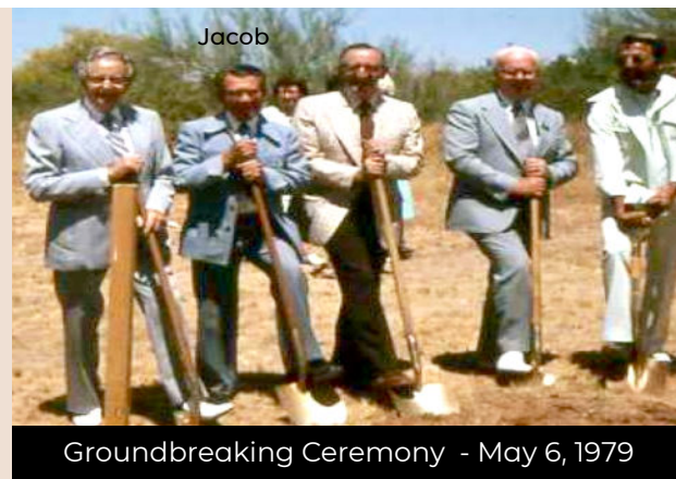
Groundbreaking Ceremony - May 6, 1979

"But those [seed] that were sown on the good soil are the ones who hear the word and accept it and bear fruit, thirtyfold and sixtyfold and a hundredfold." ~ Mark 4:20