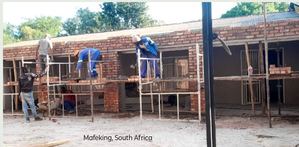
Mafeking, South Africa