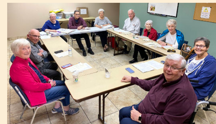
This Life Group meets Wednesdays @ 1:30pm in Fireside Room