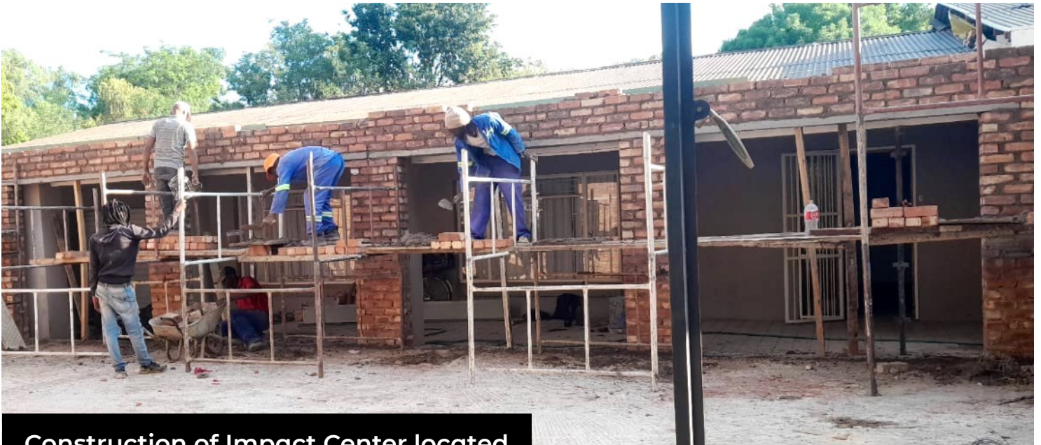
Construction of Impact Center located in Mahikeng (as of March 2024)

Victory Lutheran has been a key partner in the launch of the new Orchard Impact Center in the North West. Your investment in this building will allow church leaders to receive training in small-scale agriculture, early childhood education, small business development, orphan care, and church strengthening. This center will also offer network gatherings for pastors, empowerment programs for women facing gender-based violence, young parent workshops and future leader youth development courses.