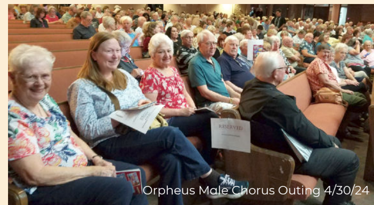
Orpheus Male Chorus Outing 4/30/24

The church bus will leave Victory at 4:00pm, for our 4:30pm reservation. On the 3rd Thursday of every month, we will alternate dinner one month, lunch the next month to satisfy everyone's time preferences.