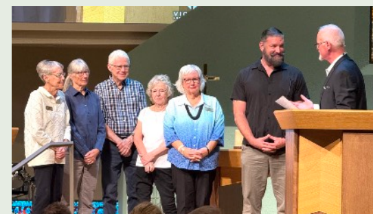
Microsite Team Commissioning - November 16, 2025