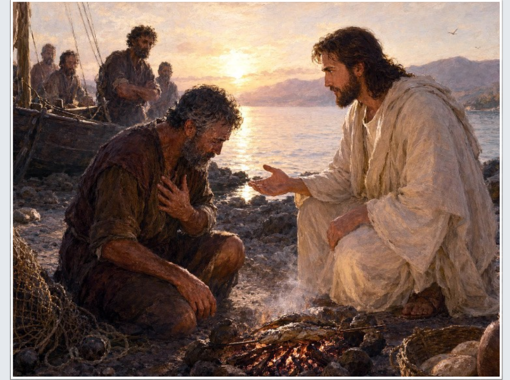
Peter denied Jesus by a fire. Jesus restored him by a fire. Grace has a way of returning to the very place that hurt.

With each question and each word of forgiveness, Jesus reaches into Peter's failure, calls forth love where there had been fear, and entrusts him once again with the care of His sheep. That is the hope of this Gospel: our sin may wound us deeply, but it cannot put us beyond the reach of the Savior who still forgives, restores, and calls His people forward.