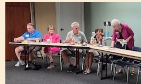
Discovering Victory Class - April 2026